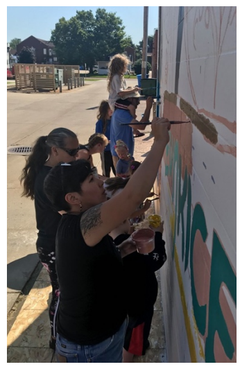
Community members add color to

In early 2019, the lead artists held public meetings, during which they invited members of the community to share their thoughts on what they would like to see represented in a mural through workshops that included storytelling, drawings, and poetry. Their design was informed by these input sessions. mural outlines in July 2019.