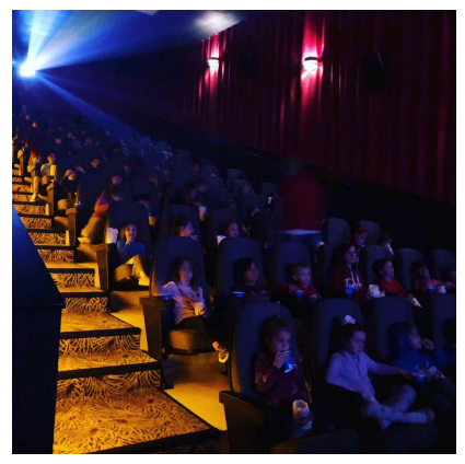
Vermillion kiddos settle in for a movie.

Other community partners for public and private showings in 2019 included the Vermillion Area Chamber & Development Company, Osher Lifelong Learning Institute, South Dakota Shakespeare Festival, Sanford Care Center, newly founded Vermillion PRIDE, and the Vermillion Area Arts Council (VAAC).