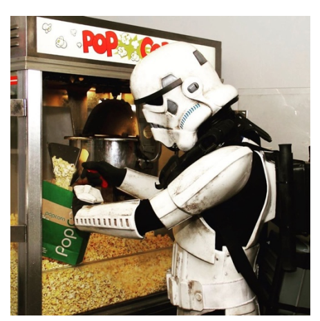
A stormtrooper serves popcorn at the Coyote Twin in December 2019.

This year brought a bumper crop of Hollywood blockbusters to the Coyote Twin Theater . Avengers: Endgame opened at the end of April and promptly sold out twelve shows. Thanks to Toy Story 4 , Spider-Man: Far from Home , and The Lion King , July 2019 went on the books as our highest-grossing month in the movie business. And, of course, Frozen II and Star Wars: The Rise of Skywalker filled seats throughout November and December. In fact, as of December 31, we totaled just under 26,000 theater admits in 2019, exactly in line with the projections from our 2015 business plan, when the Vermillion Cultural Association (VCA) undertook saving the theaters.