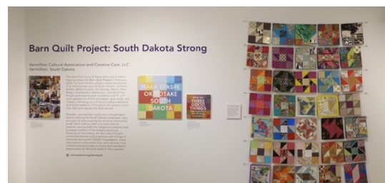
The Barn Quilt Project display features paper quilt squares and vaccine messaging materials

VCA and Creative Care were again honored by the CDC Foundation with our selection to have the Barn Quilt Project on display in the David J. Sencer CDC Museum in Atlanta, GA, January–March of 2023, as part of their Trusted Messengers: Building Confidence in the COVID-19 Vaccines through Art exhibit. Just five projects of the initial thirty grant recipients were selected for the exhibition, and we were extremely proud to represent South Dakota and the crucial role arts and culture can play in community health and wellness messaging.