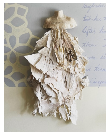
The gallery was painted with doily patterns and handwritten script during On Her Temple's Ruins