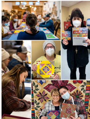
Smiling, masked faces from BQP workshops around the state

Project artists traveled to nine communities around the state throughout February and March. They arranged crafting events at well-known locations in each town, particularly at places folks were already