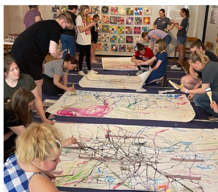
Community participant let go and paint dangerously with watercolors directed by gravity