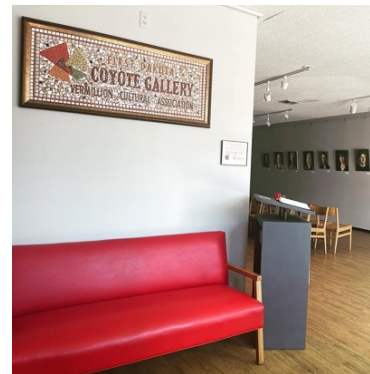
The new mosaic hangs in the gallery entryway