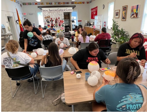
USD students at the Native American Cultural Center paint lanterns