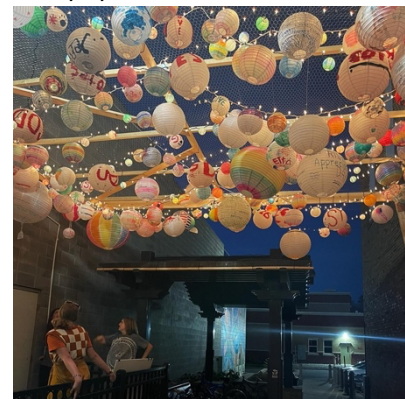
The lantern display illuminates the Pocket Park

This work was supported by the South Dakota Arts Council's Residencies for Recovery Grant, which aimed to involve artists as creative problem solvers, who are able to build community bonds. Our objective was to demonstrate that one the best things about living in Vermillion is how many arts organizations we have that enrich, entertain, and educate us. From dance classes to mending circles and movie nights to community theater, there's always something to be part of or a production to attend.